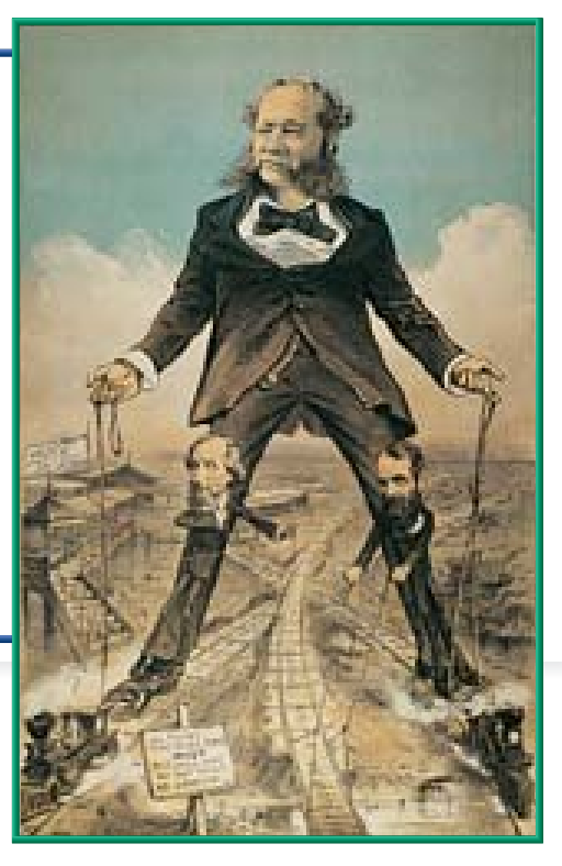
Vocabulary consolidation: the act of uniting or combining

PANIC AND CONSOLIDATION Although the ICC presented few problems for the railroads, corporate abuses, mismanagement, overbuilding, and competition pushed many railroads to the brink of bankruptcy. Their financial problems played a major role in a nationwide economic collapse. The panic of 1893 was the worst depression up to that time: by the end of 1893, around 600 banks and 15,000 businesses had failed, and by 1895, 4 million people had lost their jobs. By the middle of 1894, a quarter of the nation's railroads had been taken over by financial companies. Large investment firms such as J. P. Morgan & Company reorganized the railroads. As the 20th century dawned, seven powerful companies held sway over two-thirds of the nation's railroad tracks.